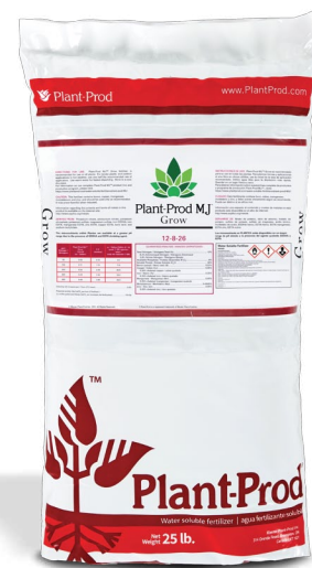
Plant-Prod MJ™ fertilizers are available in 25 lb bags.

Plant-Prod MJ™ Spike (CaMg) can be used throughout the production cycle in conjunction with any Plant-Prod MJ™ formulation, mixed in a separate tank. This completely chelated formulation of calcium (Ca) and magnesium (Mg) in a 2:1 ratio avoids the risk of interfering with bud formation, setting and sizing. Rate should be determined by water sample results, provided by your Plant-Prod sales representative.