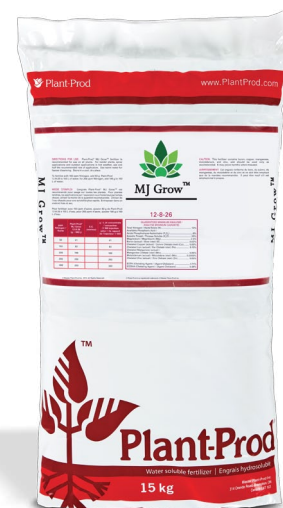
Plant-Prod MJ™ fertilizers are available in 15 kg bags.

Please contact your local Plant-Prod sales representative for a water analysis.